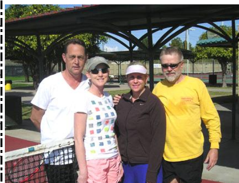
"A" consolation finals