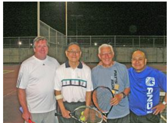
C Consolation – May, 2013