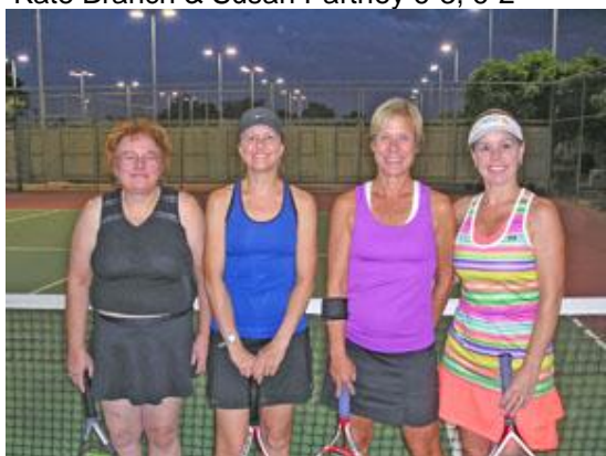
CW Final- May, 2013