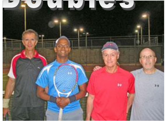
AM Round-Robin – May, 2013