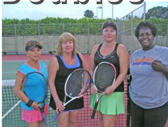
AW Round-Robin– May, 2013