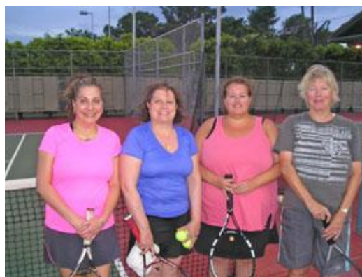
CW Consolation – May, 2013