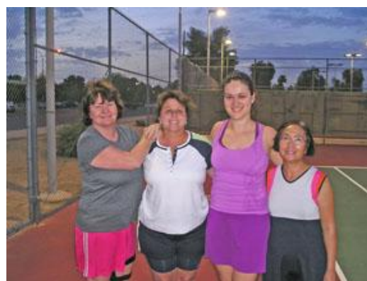
BW CONSOLATION – May, 2013