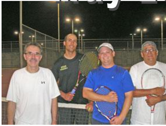
AM Round-Robin – May, 2013