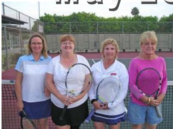
AW Round-Robin, May 2013