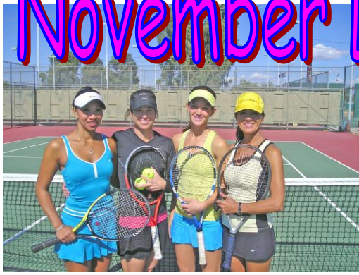
A LADIES FINAL November, 2011