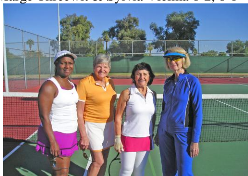
C LADIES FINAL – November, 2011