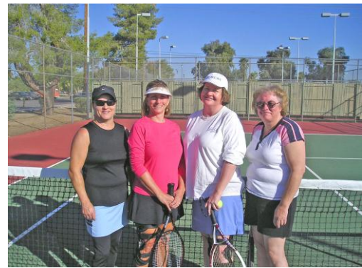
B LADIES CONSOLATION – November, 2011