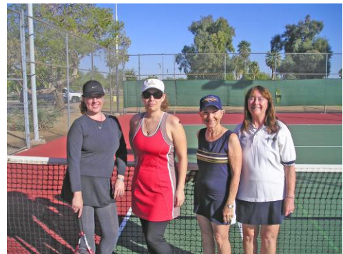
C LADIES CONSOLATION – November, 2011