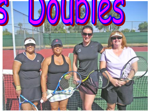
A LADIES CONSOLATION –November, 2011